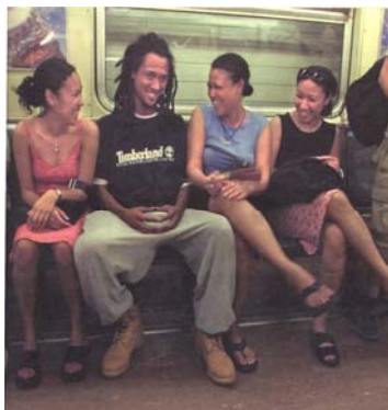
Join our Division in Philly

Session I: Images of Race and Ethnicity in the Media