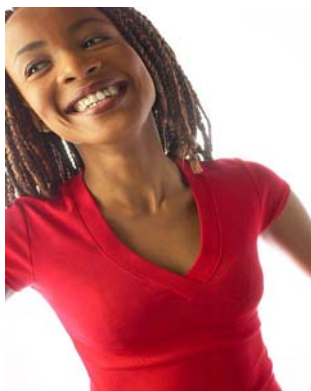
Invite a student to send in a paper.

Session XVII: Health Disparities (with Health, Health Policy, and Health Services Division)